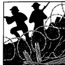
THE GREAT WAR 1914 - 1918

Popular songs, in other words, captured very accurately the mood and heart of the nation. As they always have been, their trade secrets were smiles and tears.