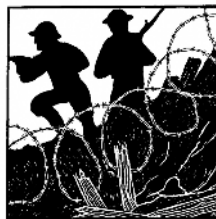
THE GREAT WAR 1914 - 1918

But in the end it was economics, not military tactics, that decided the day.