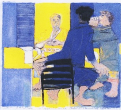
The Supper at Emmaus Ceri Richards