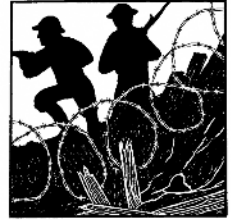
THE GREAT WAR 1914 - 1918