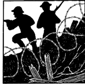
THE GREAT WAR 1914 - 1918

This was an issue that did not go away with the end of the war. Indeed, it resurfaced even more powerfully as the Thirties drew to a close and the Peace Pledge Union began to gather strength. 'If anyone strikes you on the right cheek, turn the other also', said Jesus. But what if the 'anyone' strikes not mine but someone else's cheek, or a child's cheek, or my grandmother's cheek? Do I stand helplessly by?