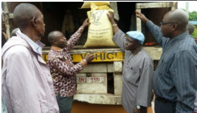
Image: The Lay Vice President of the Methodist Church of Sierra Leone (centre right), who has been living in the Ebola quarantined areas, receives bags of rice for distribution in affected communities.

All We Can announces new partnership with the Methodist Church of Sierra Leone to support and rehabilitate a new target group of Ebola survivors.