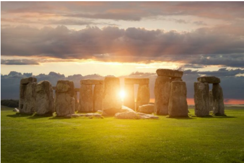
Summer Solstice - Stonehenge